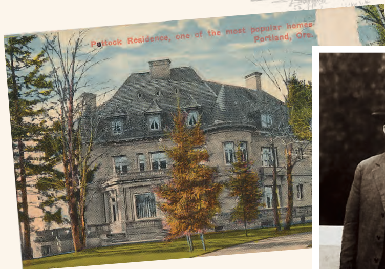
POSTCARD, CIRCA 1914.